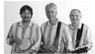
The Hipwaders Saturday December 20, 11am

Kids at the Freight is made possible through the generous support of the Bill Graham Supporting Foundation